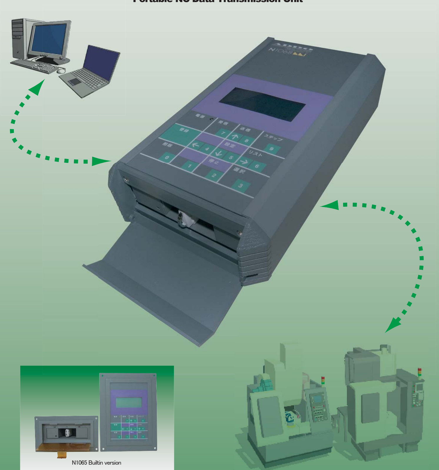
N1065 Built-in version

NC Satellite for Memory Stick Portable NC Data Transmission Unit